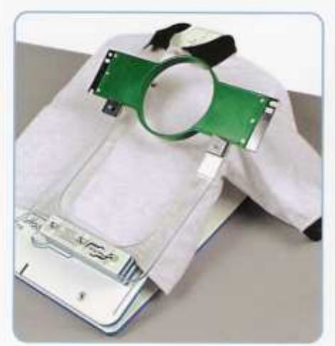
Fixture shown on the Station with shirt.